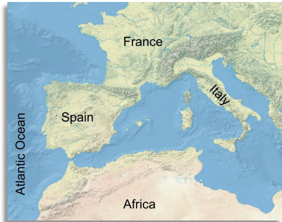
Figure 1 African Moors moved North into Europe to conquer modern-day Spain and Portugal. Like Spain, other European countries including France, and Italy were also not unified, official countries at the time.

promised him 10% of whatever profits he gained and leadership over the lands he claimed.