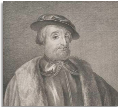
Figure 3 Hernán Cortés.

Stories like those of Cortés and Pizarro gave other conquistadors hope that they could be just as successful. Many more conquistadors would set out to find their own wealth in the Americas. This included places like Texas.