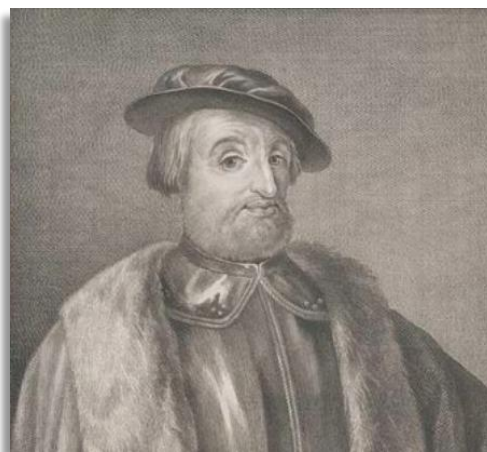
Figure 3 Hernán Cortés.

Stories like those of Cortés and Pizarro gave other conquistadors hope that they could be just as successful. Many more conquistadors would set out to find their own wealth in the Americas. This included places like Texas.