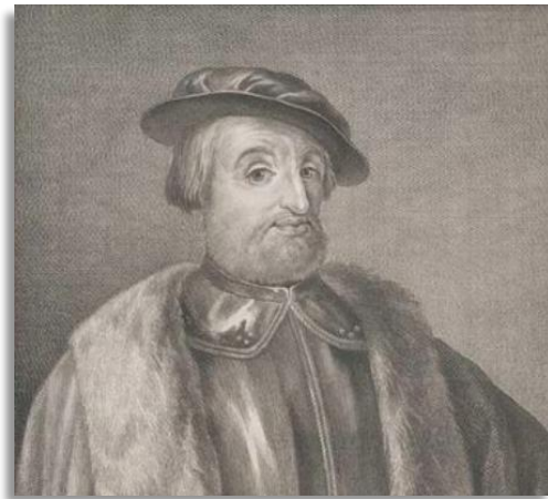
Figure 3 Hernán Cortés.

Stories like those of Cortés and Pizarro gave other conquistadors hope that they could be just as successful. Many more conquistadors would set out to find their own wealth in the Americas. This included places like Texas.