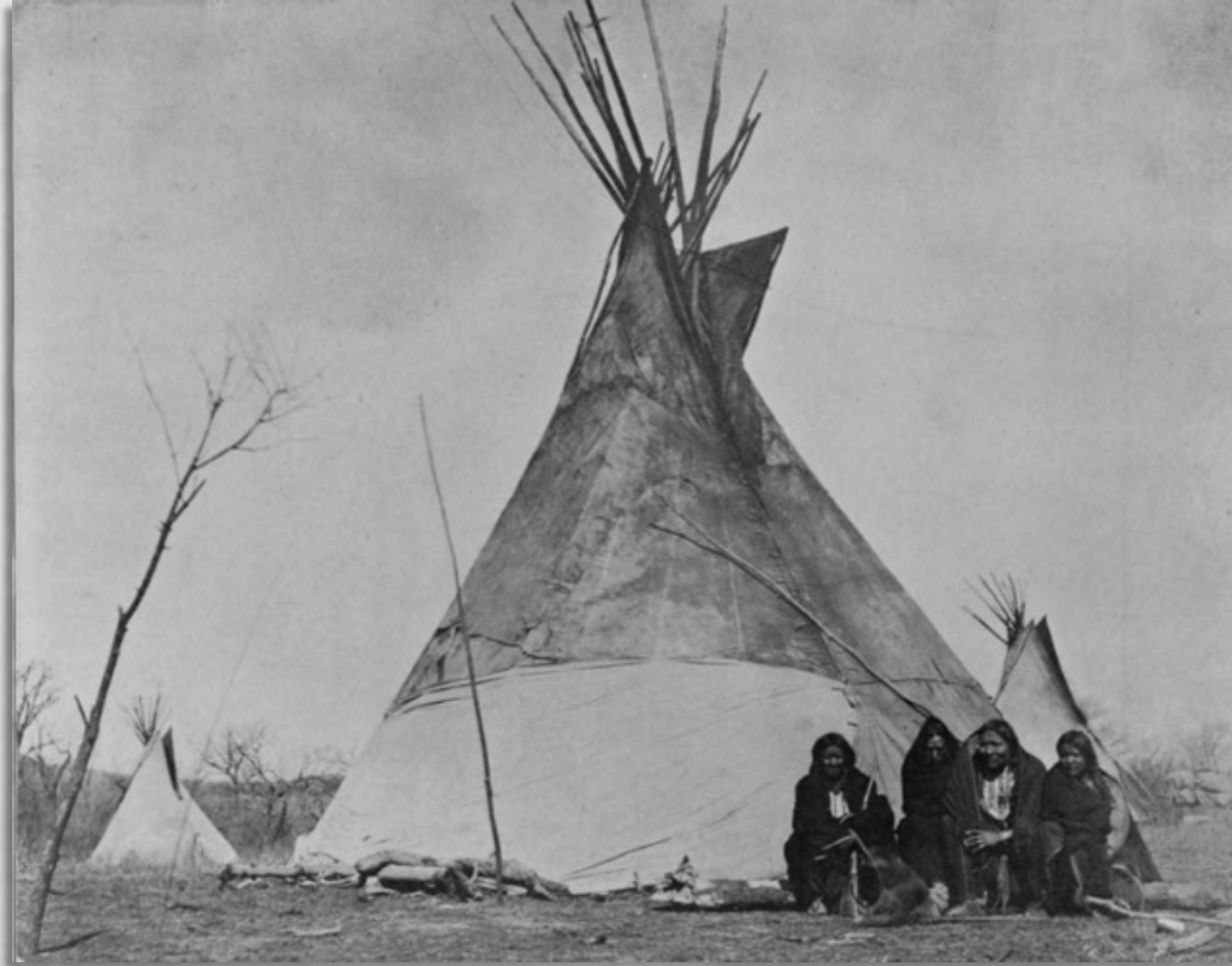
Comanche Indian camp, late 19 th Century