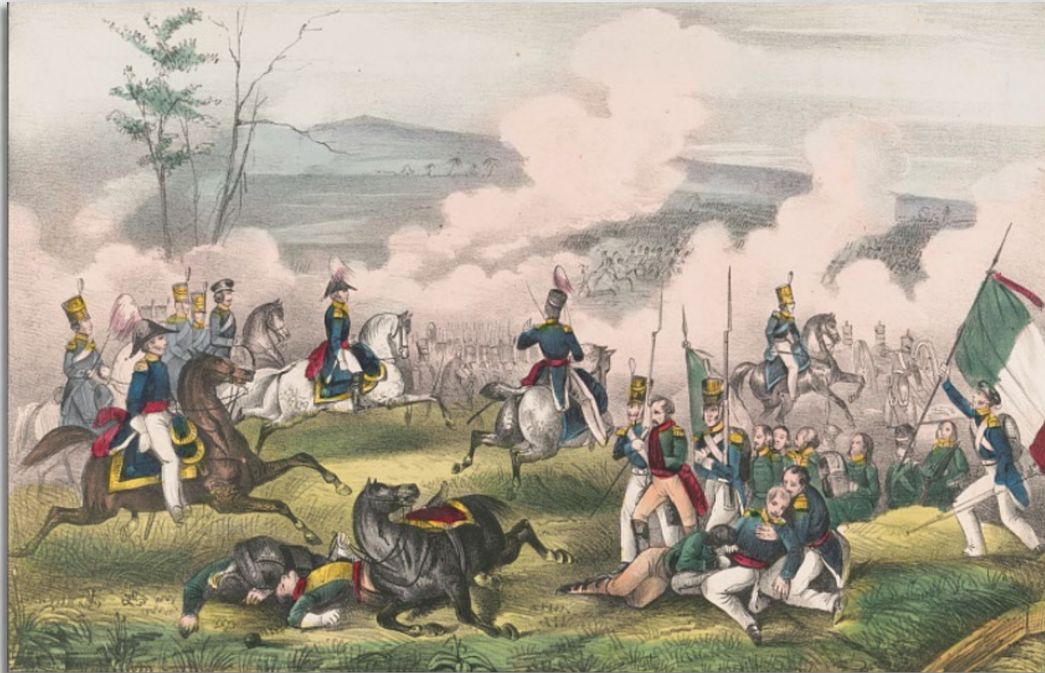
The Battle of Palo Alto: The first major battle of the U.S.-Mexico War