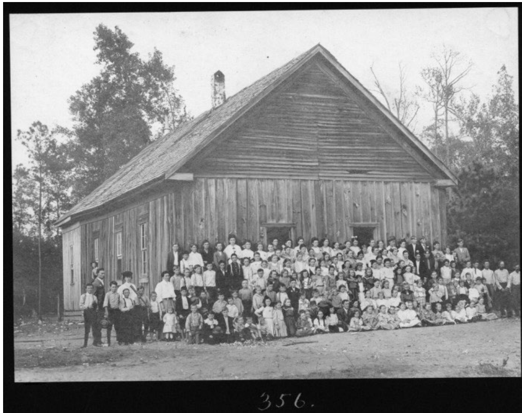
American Lumberman [White School Building], photograph, 1907;

Directions: Analyze and annotate the two images below. Highlight and discuss key similarities and differences in the images.