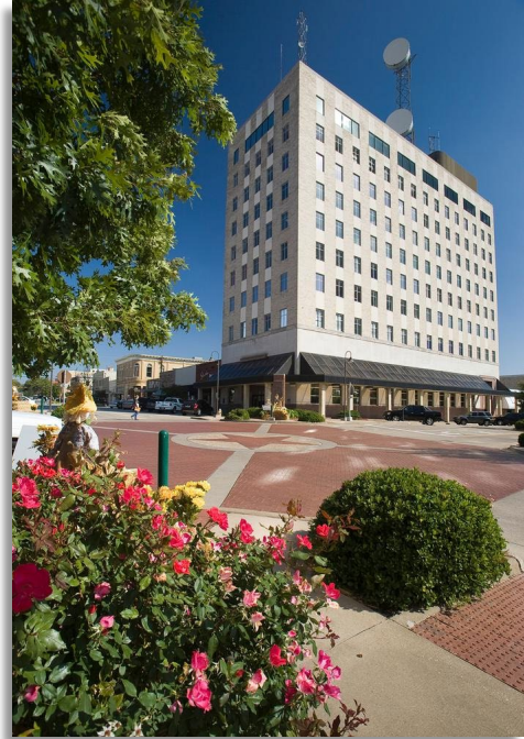
Figure 2: A city street in Longview, Texas. The Portal to Texas History.

Additionally, municipal governments are in charge of public parks, community centers, and public transportation.