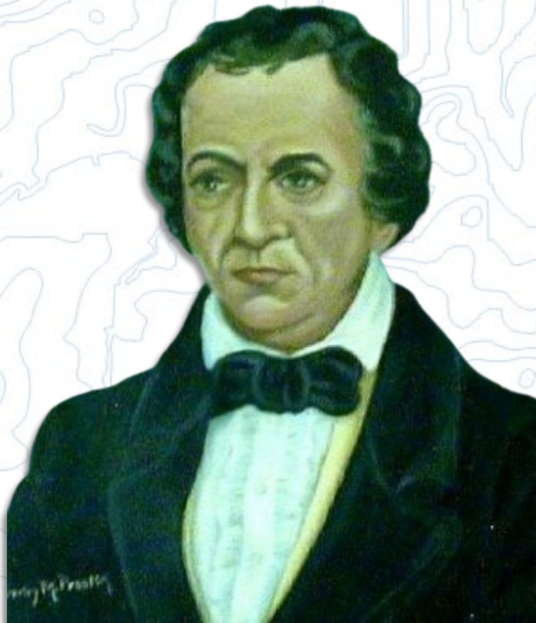
Mirabeau Lamar The Portal to Texas History