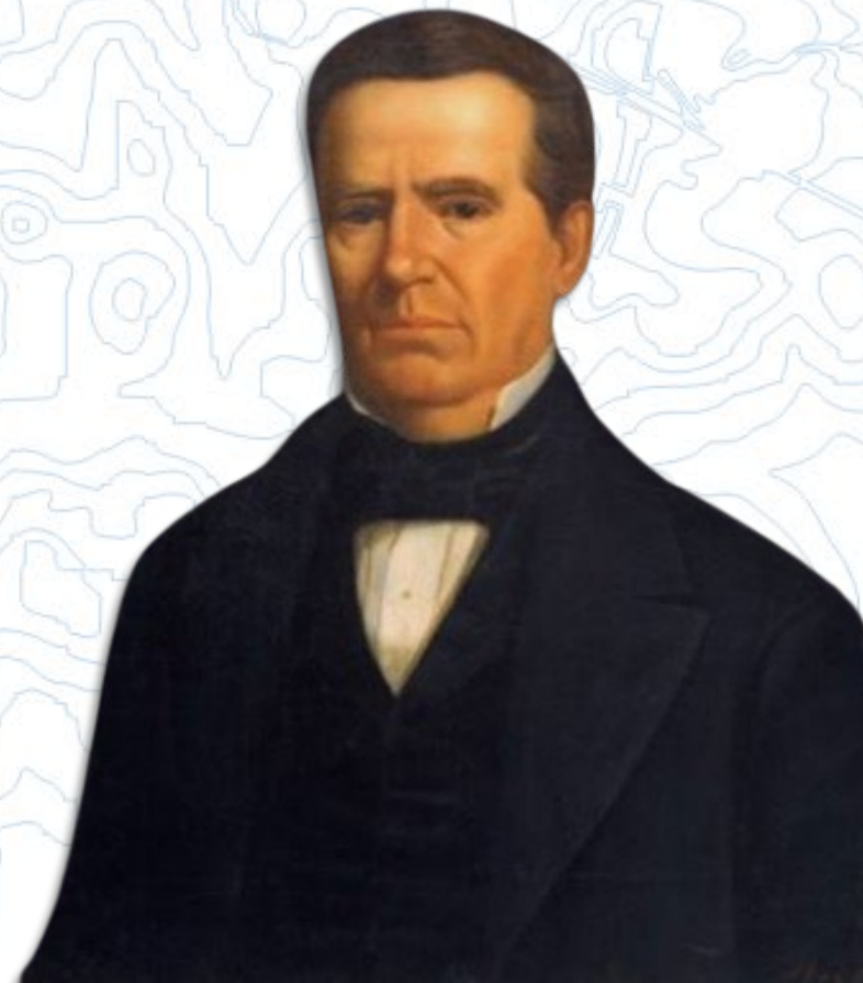
Anson Jones