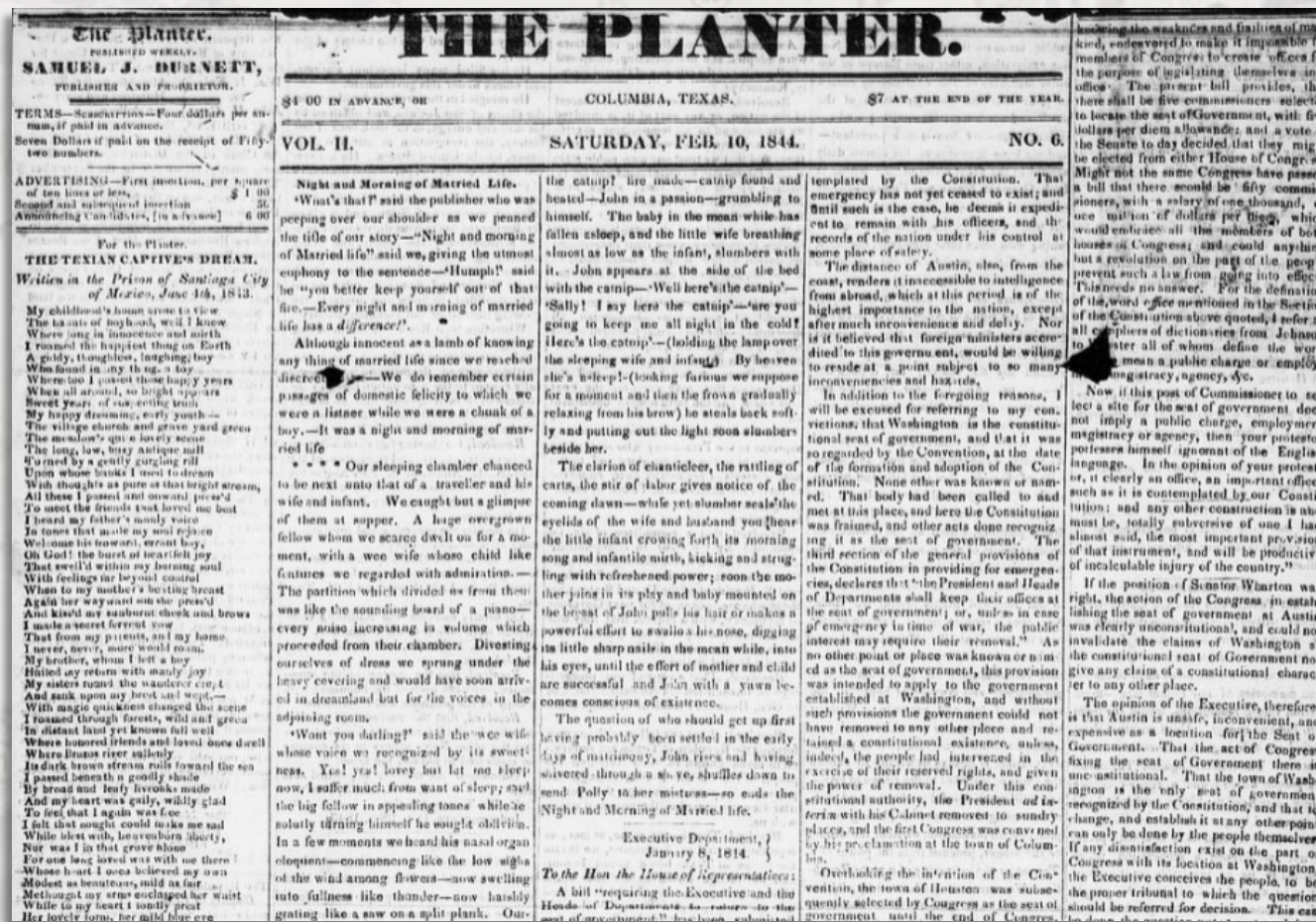
The Planter newspaper of Brazoria, Texas Saturday February 10, 1844 The Portal to Texas History