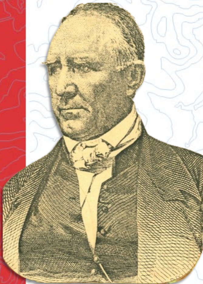
Sam Houston The Portal to Texas History