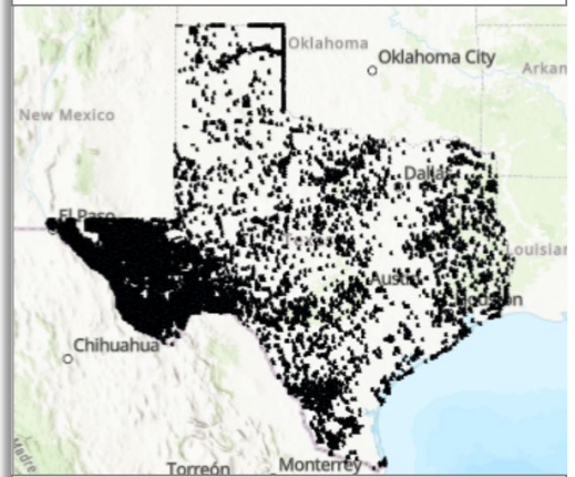
Permanent School Fund Lands (Public Lands)

Shaded black portions represent public land owned, managed, and leased by the Texas government.