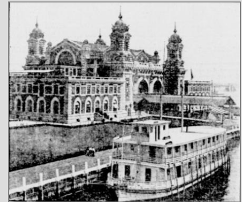
New York Tribune, August 28 th 1904

North Western Immigration The Minneapolis Journal, February 09, 1901