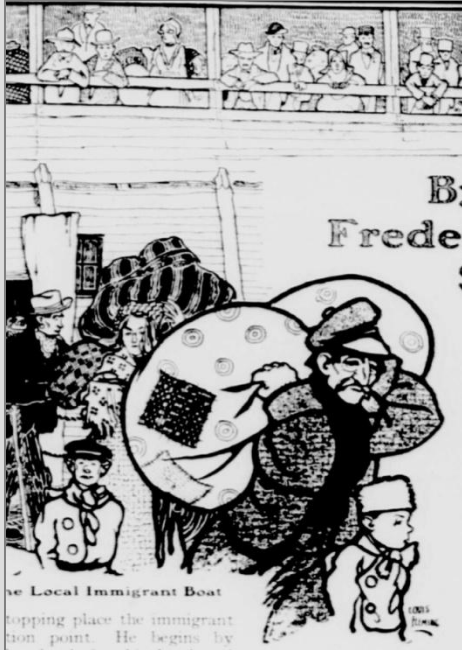
New York Tribune - July 24 th , 1904 - Image 28